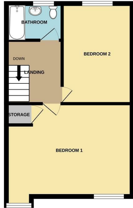
1ST FLOOR 371 sq.ft. (34.5 sq.m.) approx.